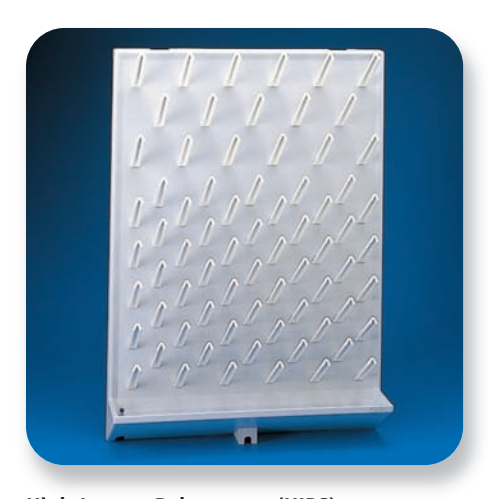
High-Impact Polystyrene (HIPS)