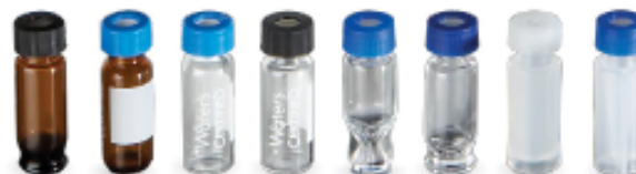
Waters Certified Vials.