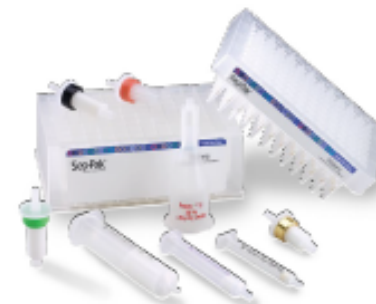
Sep-Pak SPE Cartridges.