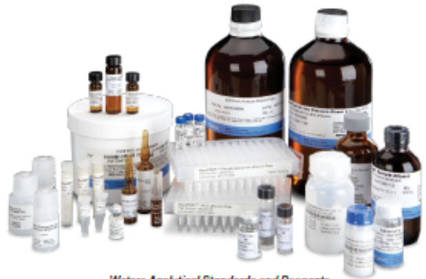
Waters Analytical Standards and Reagents.

Maximize efficiency, ruggedness, and throughput