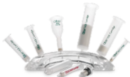
Oasis Sample Extraction Products.