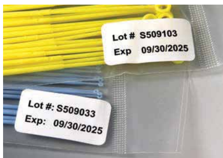
Each bag is individually labeled with lot number and expiration date