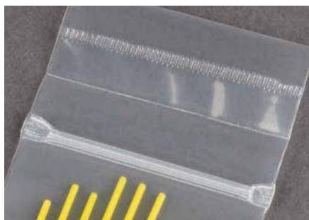
Packaged in resealable, tamper-evident bags