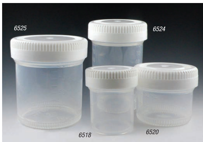
Tite-Rite™ leak resistant containers