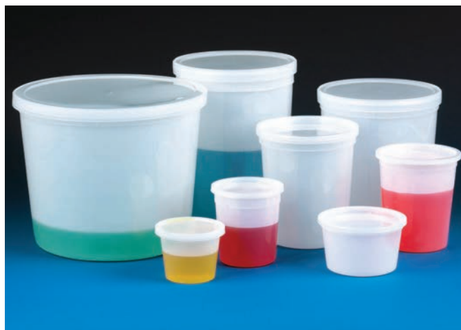
Translucent containers — 271004 – 271172