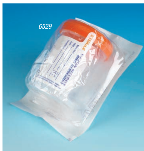
120mL container with patient I.D. and sterility assurance label, individually wrapped