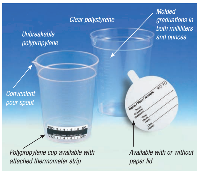
6.5 oz. collection cups (5920-5929)

Both sizes shown with attached tamper evident ID labels and thermometer strips