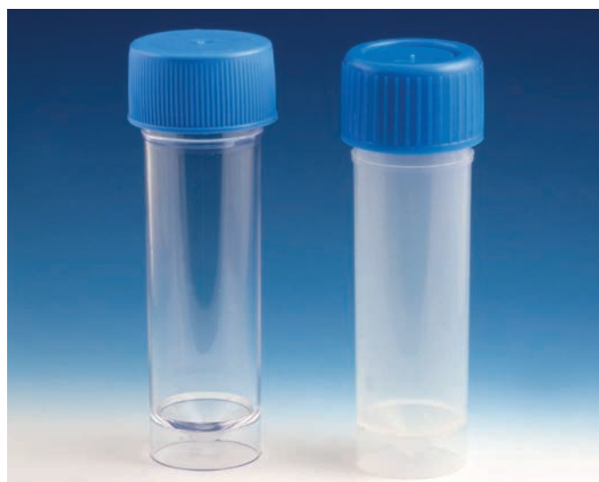
109217 — polystyrene (PS), 109220 — polypropylene (PP)