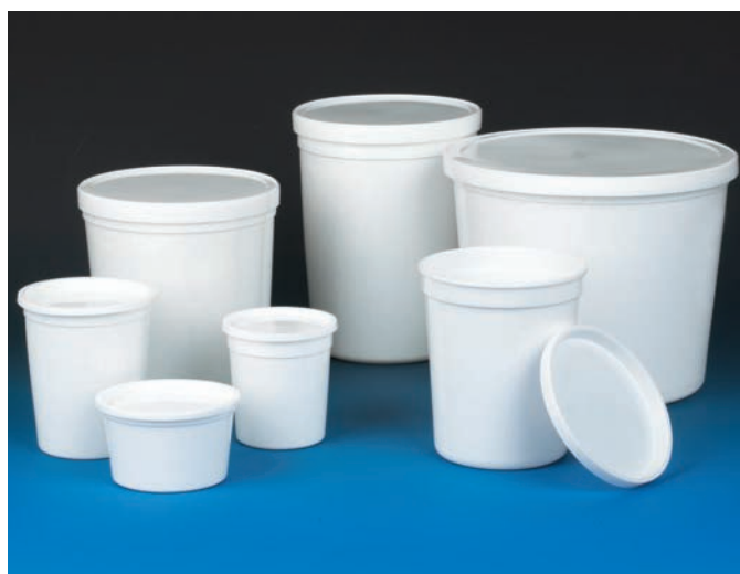
Opaque containers — 271008W – 271172W