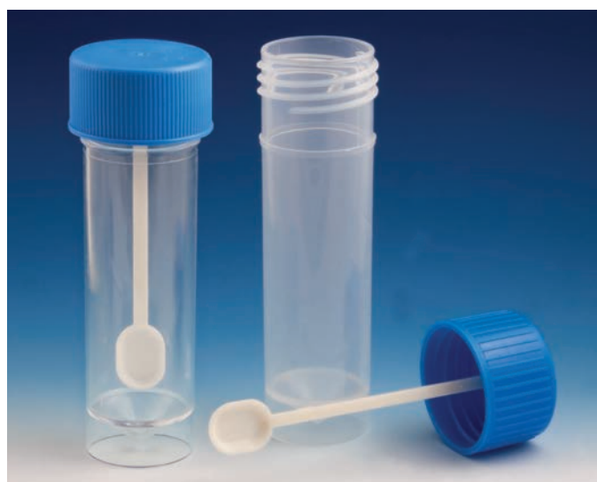
109117 — polystyrene (PS), 109120 — polypropylene (PP)